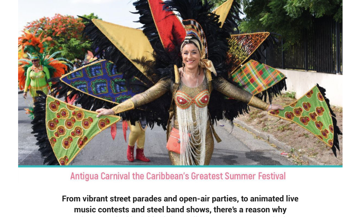
Antigua Carnival is dubbed the Caribbean's Summer Festival.

also bring you the highlights of Romance Month, the latest on the Moon Gate Hotel & Spa and how a very special new arrival is helping to keep the island's stunning coastline in pristine shape.