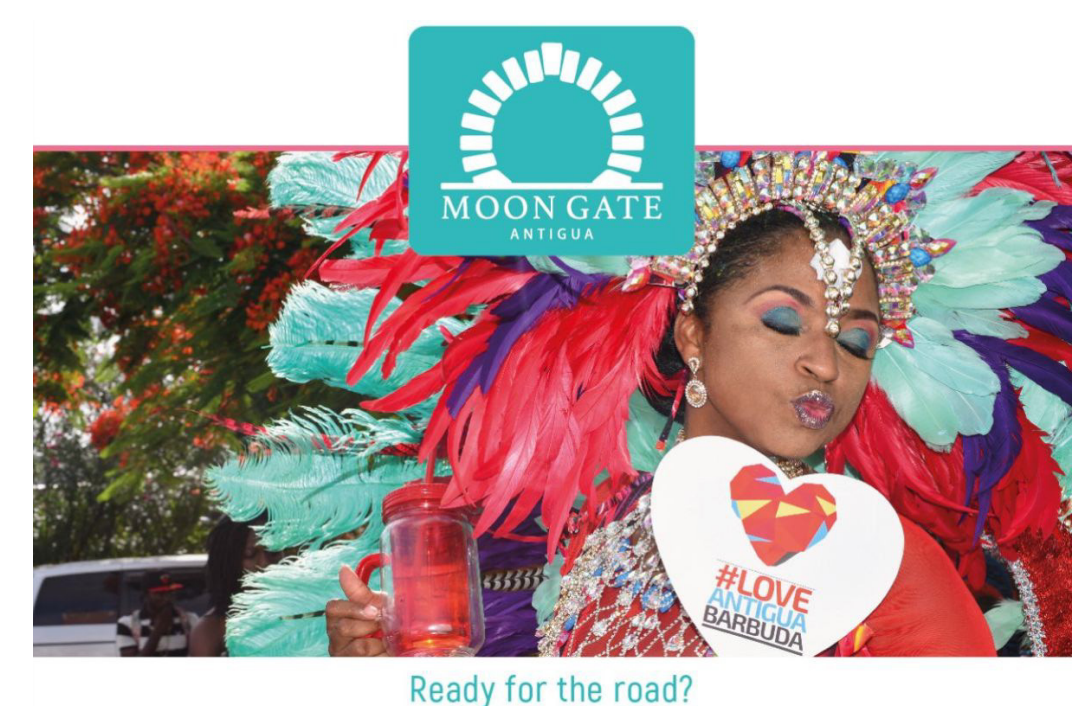
Get those dancing shoes ready - this hip-swinging edition gives you the